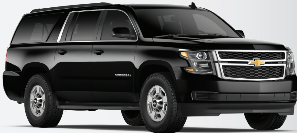
*LT - Pre production shown.