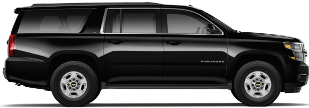
*LT - Pre production shown.