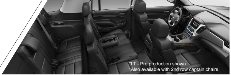
*LT - Pre production shown. *Also available with 2nd row captain chairs.